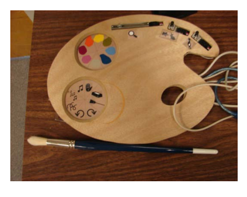
figure 2: Vuzik icon palette and brush.

y-axis position corresponds to pitch; the x-axis length reflects rhythm on a time continuum running left to right; each colour is paired to a unique instrument timbre; and the thickness of the line reflects the loudness. The mapping underlying Vuzik's design aims to leverage people's understanding of common physical concepts (e.g. height, size, space, length), in an attempt to be easily understood by various people, with specific attention to young learners. Additionally, in order to promote music learning and pave the way for future music education, the mapping choices are also consistent with the basic graphic principles employed in traditional music notation and certain metaphorical phrases commonly used by musicians, such as "tone colour," and "lengths of notes." This capability of Vuzik to simply and directly link sound to visuals lets people visualize the music they are creating and thereby more easily understand its construction.