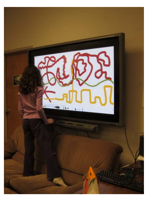
figure 4: Ten-year old interacting with Vuzik.